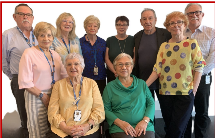
Heartbeat Epworth 2024-25 Committee