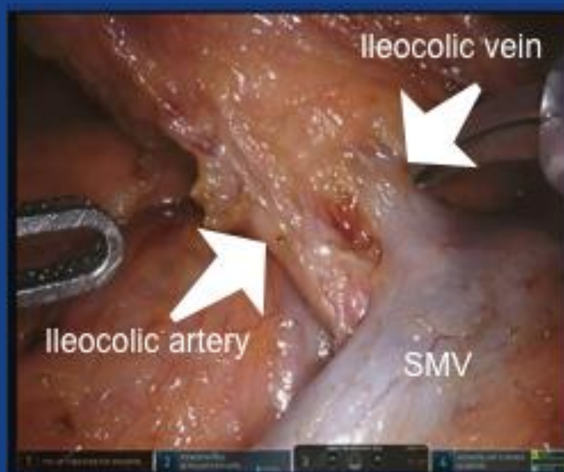
Fig 2 Ileocolic pedicle dissection. Superior mesentery vein, inferior mesentery vein and artery on view.