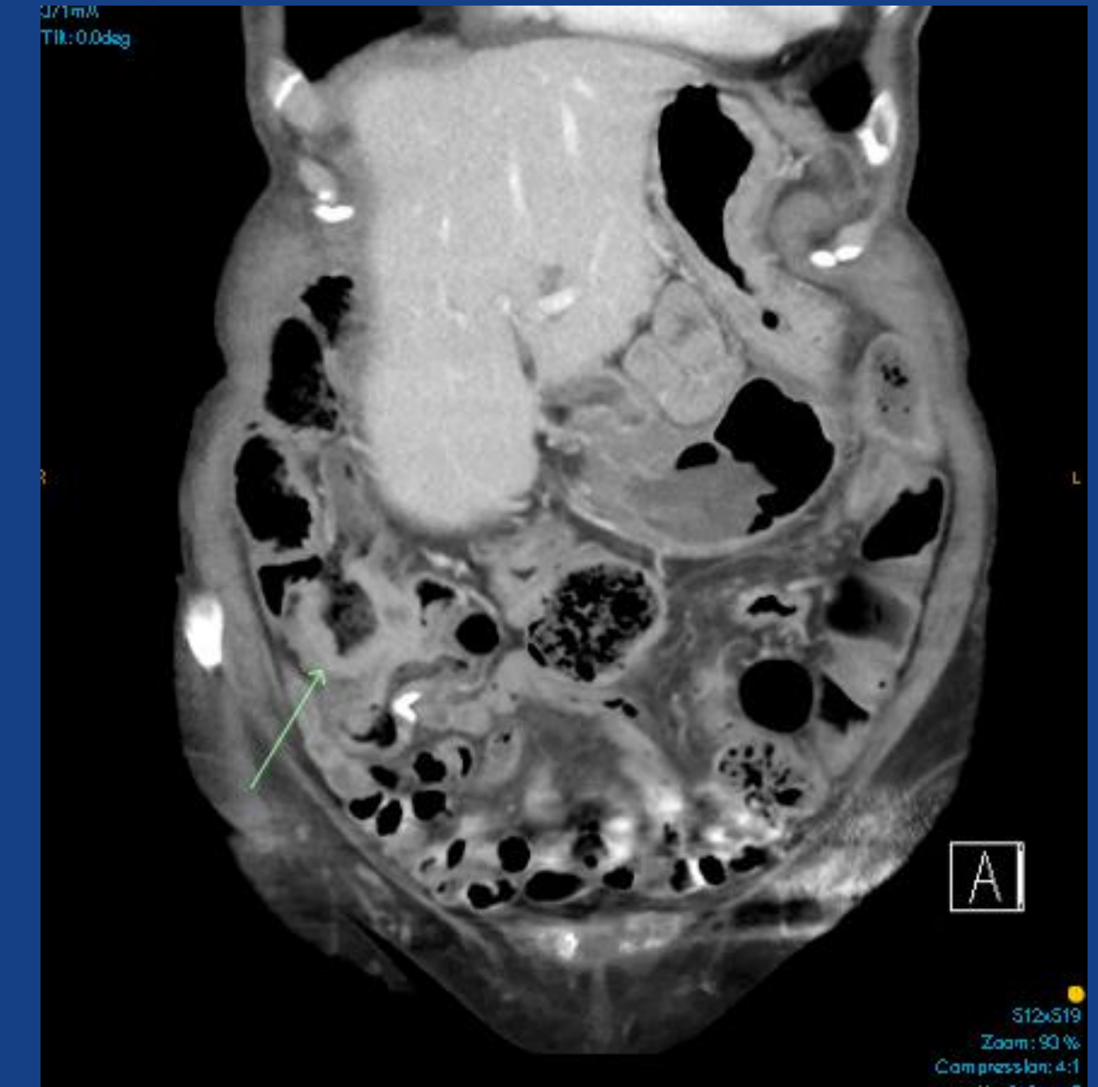
Fig 1 Coronal C+ with arrow indicating abnormal caecal mural thickening.